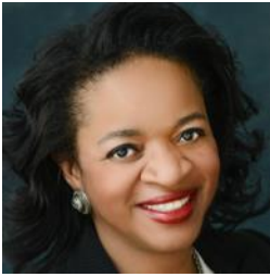
Tanya Clay House Deputy Assistant Secretary for P-12 Education, U.S. Department of Education

lected committees of students within the city, state, and national departments of education so that every young person can co-create, inform, and sustain the integrated schools that they attend.