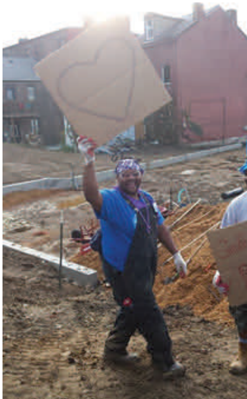
Playground build organized by the tenants of North Side Properties

Depending on the scope of work, rehabilitation and upgrades are done either while tenants remain in the unit, when a tenant moves out, or with a unit transfer within North Side Properties.