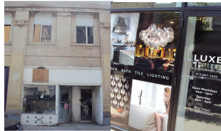
Closed after 56 years on Penn Avenue

Street vendors were chased from Penn Avenue. This used to be a low-cost business option for low-income entrepreneurs.