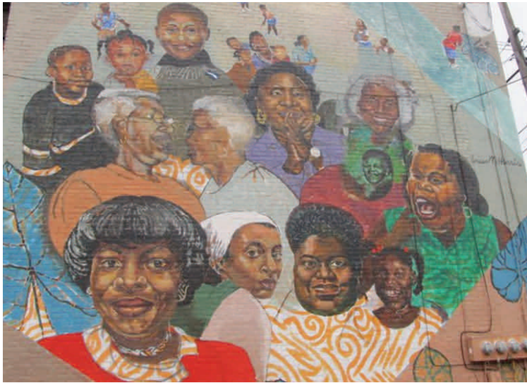
“Women of the North Side” mural, North Side Properties