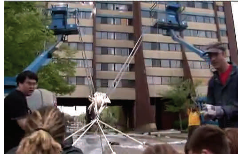
“Artists” lob paintballs at East Liberty residents’ former homes

Urban renewal in the 1960s created dense, mixed-income rental housing that became entirely low-income and HUD-subsidized after years of neglect. In the late 1990s, the neighborhood CDC (ELDI) developed a plan to replace the largest subsidized housing community (Federal American Properties or FAP) with less dense mixed-income housing owned by a more responsible set of landlords. Hundreds of low-income people were uprooted and displaced. Of the 546 original households, only about 150 were able to remain in East Liberty and/or move to the new housing. Street vendors were chased from the commercial core. At least 14 locally-owned businesses were displaced or lost their clientele and were forced to close. National chains and high-end retail establishments were enticed to locate in East Liberty and hundreds of units of luxury housing are being built. The displacement of low-income tenants continues with the flipping of occupied rental properties, rapid increases in market rents, and the imminent closure of the 312 unit Penn Plaza apartment complex for redevelopment as high-price market rental.