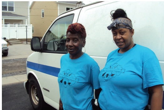
Premier Touch Cleaning Company

NCFH created a tenant-owned cleaning company to clean the common areas and turnover units at North Side Properties. The business is now expanding to other properties.