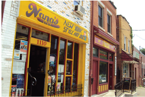
Preserved, new and long-time businesses on Federal Street

A Neighborhood CDC (ACCA) adopted a strategy to preserve/attract locally-owned businesses in 2009. Since then, at least 4 such businesses have located in the main business district.