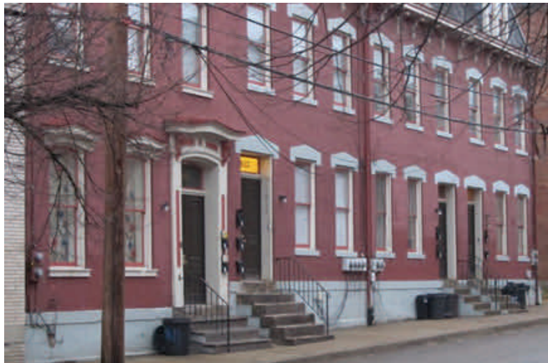
North Side Properties units, California-Kirkbride

NCFH’s ownership interest gives the tenants of North Side Properties veto power over any sale of units or changes to affordability. That will ensure that the properties will remain affordable for years to come.